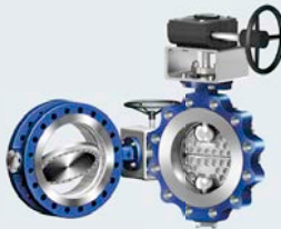
Process Valves ZETRIX® High Performance-Valves ZEDOX®