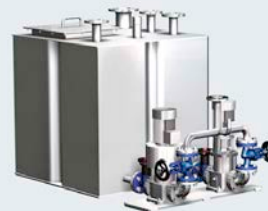
Condensate return system CORsys®