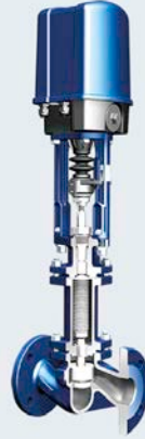
STEVI® Smart (BR 423/463, 425/426, 440/441, 450/451)