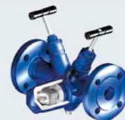
Steam traps with multi- valving technology CONA® "All-in-One" (incl. stop valve, inside strainer, back-flow protection, drain valve)