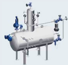
Feedwater tank with deaerator dome