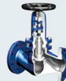
Bellows sealed valves FABA® Plus, FABA® Supra I/C