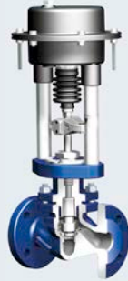
STEVI® Vario (BR 448/449)