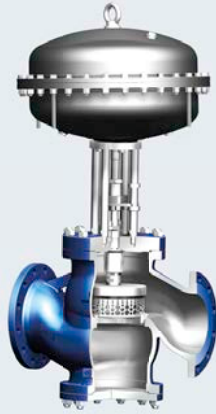
Control valves STEVI® Pro (BR 422/462, 470/471)