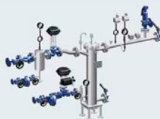
Heat exchanger ENCOsys®