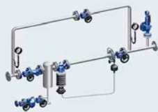
Pressure reducing station PREsys®