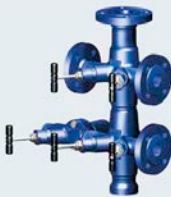
Manifolds CODI® for collecting and diverting purpose