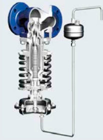
Control without auxiliary power PREDU® / PREDEX® / PRESO® / TEMPTROL®