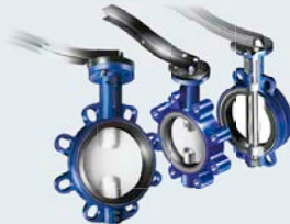
Butterfly valves ZESA®/GESA®/ZIVA®